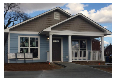
589 and 581 Vernon St.

The second home, 581 Vernon Street, is Habitat for Humanity's first four bedroom home. Flooring has been installed and landscaping will be underway soon. Both homes will be completed by the end of March.